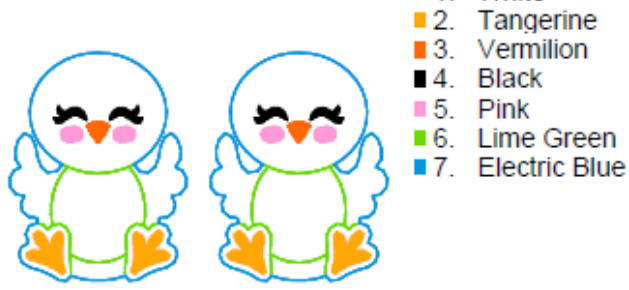
Chickenhappy 60mm Sorted.pes 99.10x60.00 mm; 4,099 stitches 7 thread changes; 7 colors

99.90x99.90 mm; 7,642 stitches 7 thread changes; 7 colors 1. White